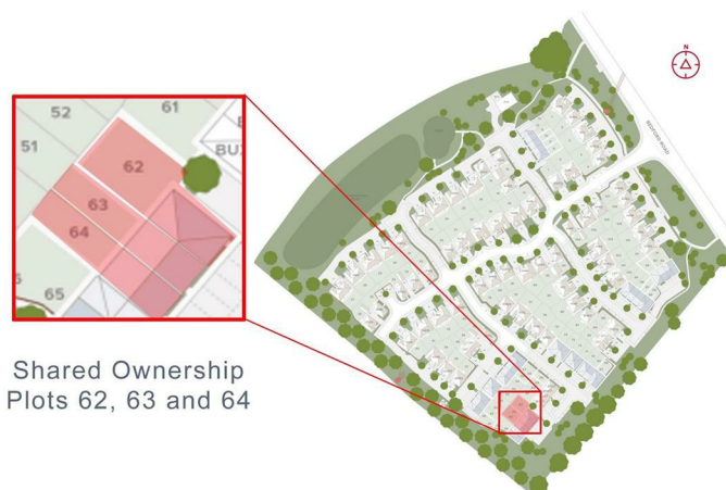
Shared Ownership Plots 62, 63 and 64